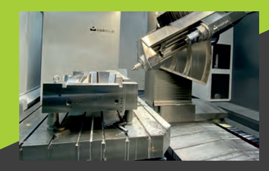
Horizontal Machining Centre with Angular capacity and Deep Hole Drilling

Since its start, the company integrates a team with extensive national and international experience and with demonstrated results in the sector. In fact, it was the dissatisfaction with the functional limitations of the machines used in the mold industry, which created the opportunity to develop a new business project. Only with the accumulated experience of the team, the deep knowledge of the molds' production process and the domain in the development of high precision CNC machines, it is possible to raise the bar of the current state of the art, establishing a new product of great impact in the sector.